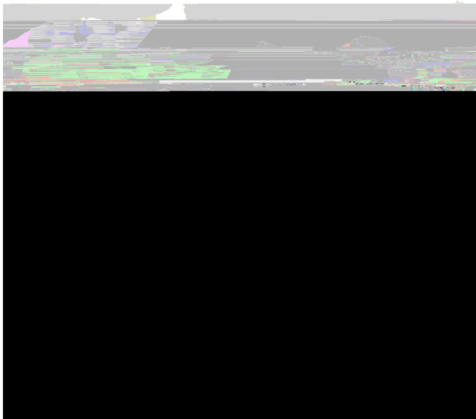
Figure 1 - Areas of control as of December 13, 2017. Arrows indicate advances made during the reporting period.

A political standoff is due to come to a head in the opposition-held Idlib pocket with the HTS-backed Salvation Government calling for the rival Syrian Interim Government (SIG) to vacate all offices by Friday, December 15. The SIG has called on units affiliated with the Free Syrian Army to protect SIG personnel and offices. Elsewhere, ISIS forces in eastern Hama governorate significantly expanded their territorial control, capturing at least seven small towns from HTS, briefly entering the administrative border of Idlib governorate before being pushed back by an HTS counteroffensive. ISIS advances in the area have benefitted from heavy Russian and government aerial bombardment of opposition forces as well as a simultaneous government offensive 15km to the west of ISIS positions. Government troop movements in the area are poised for a major offensive most likely in an effort to take the Abu Dhuhur air base and gain control over the Hama-Aleppo highway.