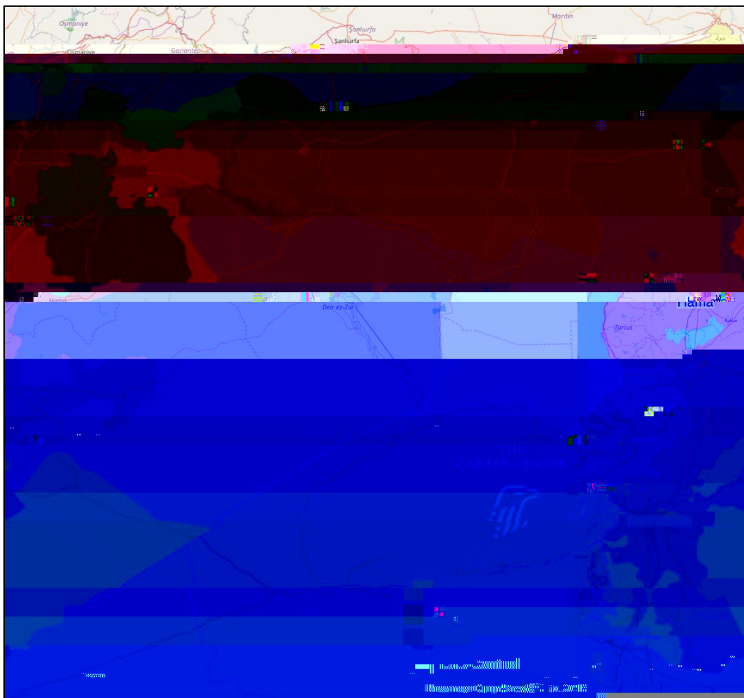
Figure 1 - Areas of control in Syria as of April 19

During this reporting period, negotiations surrounding the ongoing “Four Towns Agreement” continued despite the appalling attack on civilians being evacuated from the pro-government enclave of al-Fo’ah and Kafraya. Pro-government forces succeeded in their attempts to reverse the overwhelming majority of the opposition’s previous advances in northern Hama countryside, though fighting remains fierce. ISIS forces briefly retaliated after months of significant territorial loss, but continue to lose territory on several fronts. Opposition forces advanced against government forces in Daraa city and forced a minor withdrawal of pro-government forces to the east of Damascus.