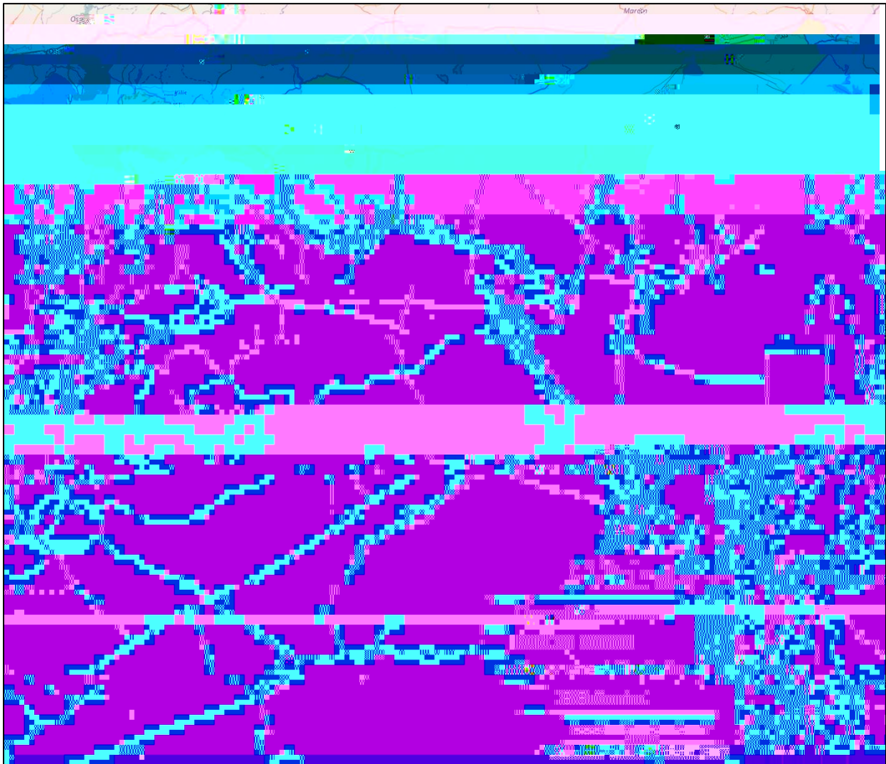
Figure 1 - Areas of control in Syria by May 10

During the reporting period, elements of an Astana de-escalation plan were enacted while pro-government forces advanced in Hama and the Eastern Ghouta region of Damascus. Opposition infighting in Eastern Ghouta and Idleb appears to have stopped for the time being. Fighting in and around Daraa city remained high this week, and both opposition and the predominantly Kurdish Syrian Democratic Forces (SDF) continued to take territory from ISIS.